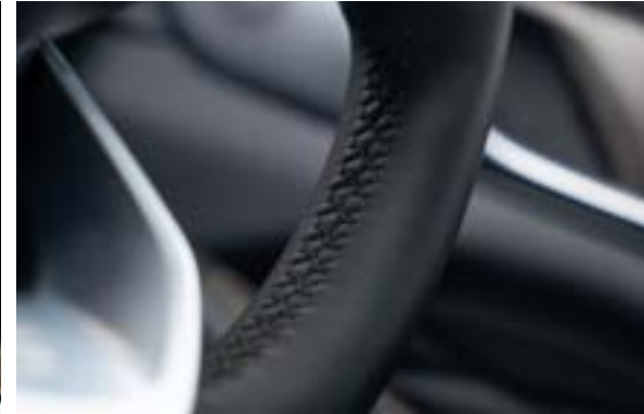
HEATED, ECO-LEATHER STEERING WHEEL