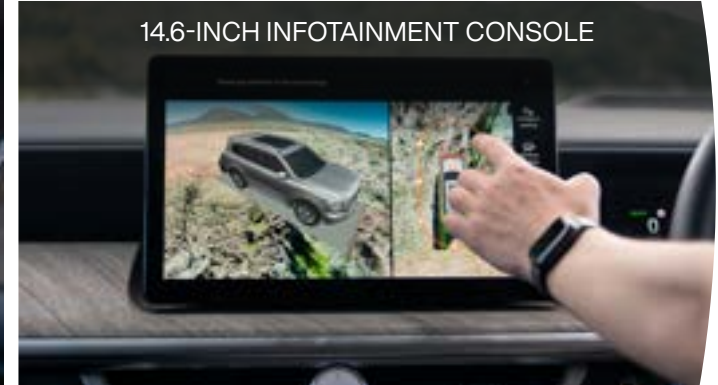
14.6-INCH INFOTAINMENT CONSOLE