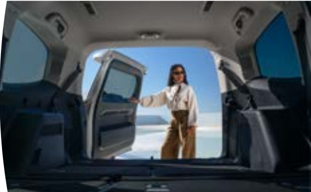
A CAVERNOUS 1 489 LITRES OF BOOT SPACE