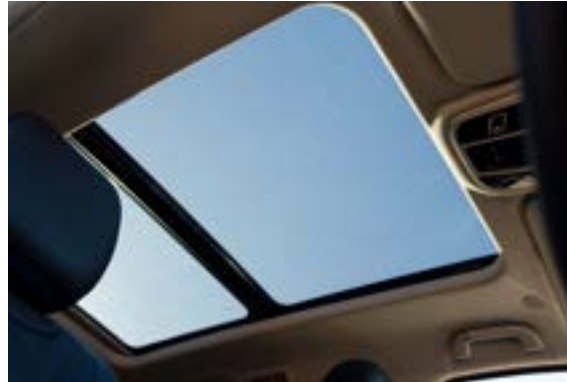
EXPANSIVE PANORAMIC SUNROOF