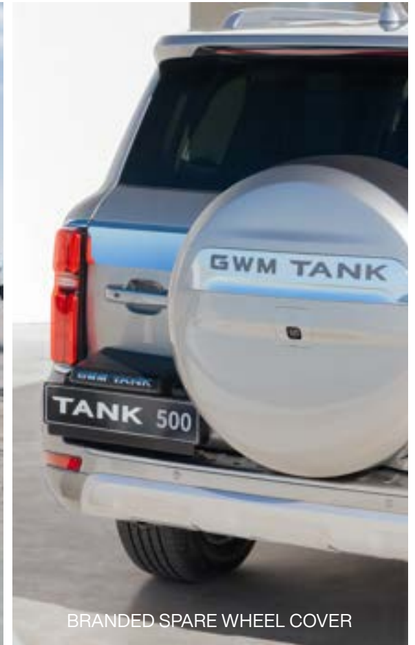
BRANDED SPARE WHEEL COVER