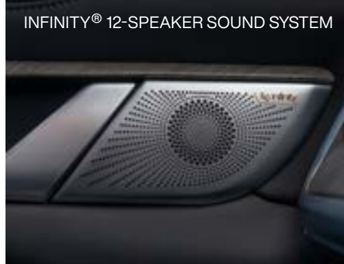
INFINITI® 12-SPEAKER SOUND SYSTEM