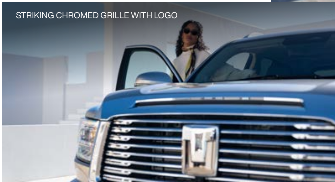
STRIKING CHROMED GRILLE WITH LOGO

Every detail of this lavishly appointed SUV has been carefully designed with your comfort in mind. The exterior boasts a striking chromed Front Grille, grand 20 inch Alloy Wheels and Automatic Side Steps which make entry and exit a luxurious pleasure.