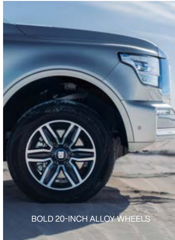
BOLD 20-INCH ALLOY WHEELS